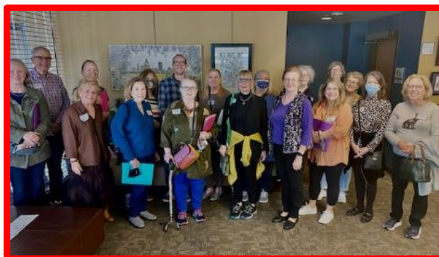
Georgetown Art Tour, December 2021

Because of studio size (and the fact that she works with a torch!), space is limited to 20 participants. Parking is on the street so please carpool if possible. Masks are required in the studio. Lunch options will be announced later. Visit the website for a sneak preview. https://www.ritamarieross.com