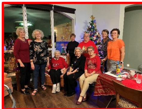
Holiday Cookie Exchange and International Dinner 2021