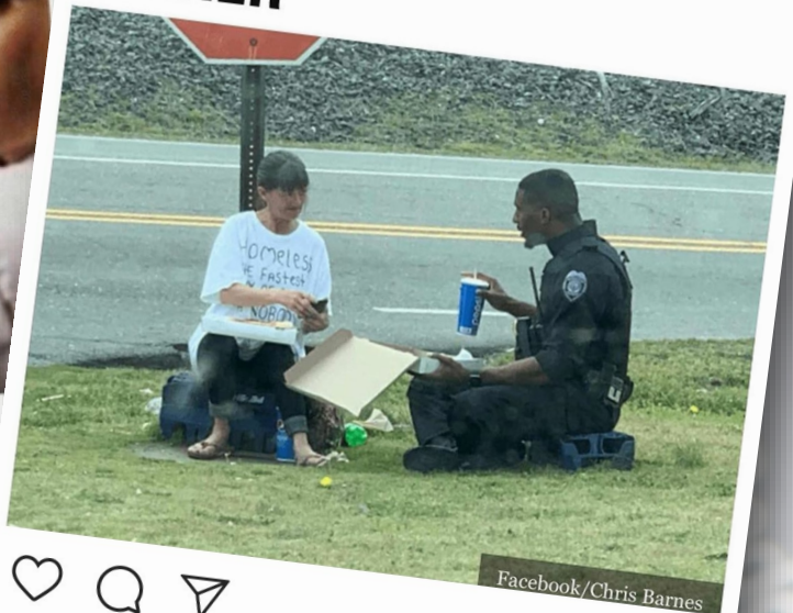
PHOTO: POLICEMAN TAKES LUNCH BREAK WITH WOMAN ON STREET CORNER