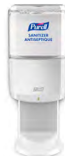
Product 7 cXY. 3770-12-CAN00

The Purell ES8 system is one of the most trusted hand hygiene products that kills more than 99.9% of illness causing germs. This dispenser is designed to dispense the correct amount needed in order to effectively sanitize hands. Used in conjunction with proper hand washing, absenteeism can be reduced up to 60%.