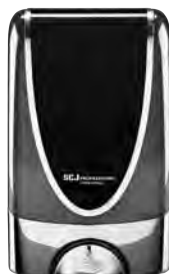
Product 7 cXY. TF2CHR

Helping to reduce the amount bacteria spread in the restroom, the TouchFree Ultra Dispenser gives out the precise quantity of soap, removing upwards of 99.9% of dirt and germs.