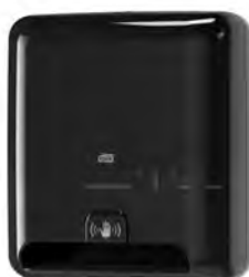
Product 7 cXY. 5511282

The Tork Matic® Towel Dispenser, is a touch-free system that virtually eliminates cross contamination while also reducing towel waste. The one-at-a-time towel dispensing system ensures a hygienic towel every time as guests are only touching the towel they are using. The sleek modern design not only leaves a good impression but also your guests with a piece of mind.