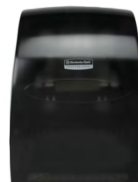
Product 7 cXY. 09992

Less frequent refilling and consistent, reliable performance means less maintenance and fewer customer complaints.