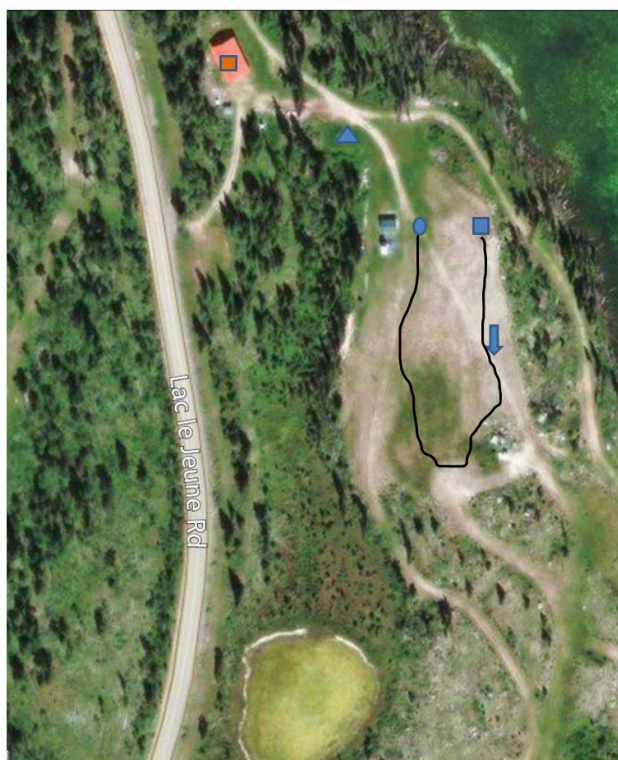
Overlander Ski Club - 300m Course