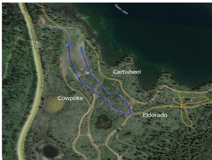
Overlander Ski Club 0.6km Course