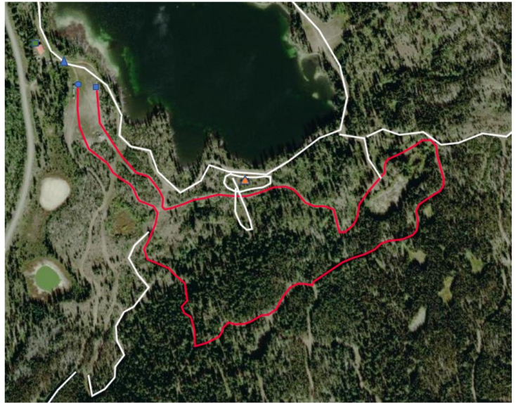
Overlander Ski Club 2.5 km