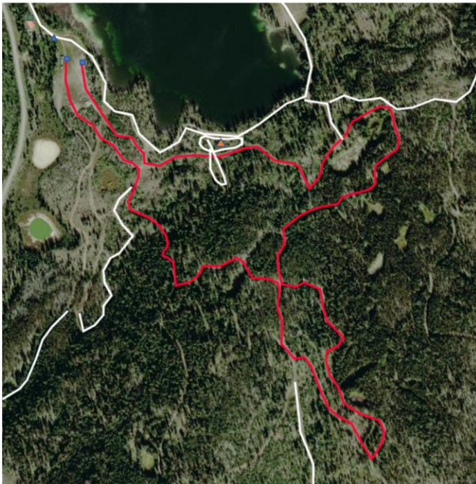
Overlander Ski Club 3.5 km