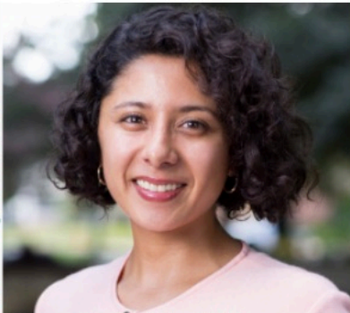
Judge Lina Hidalgo Harris County

2019 Latino Health Summit Keynote Speakers