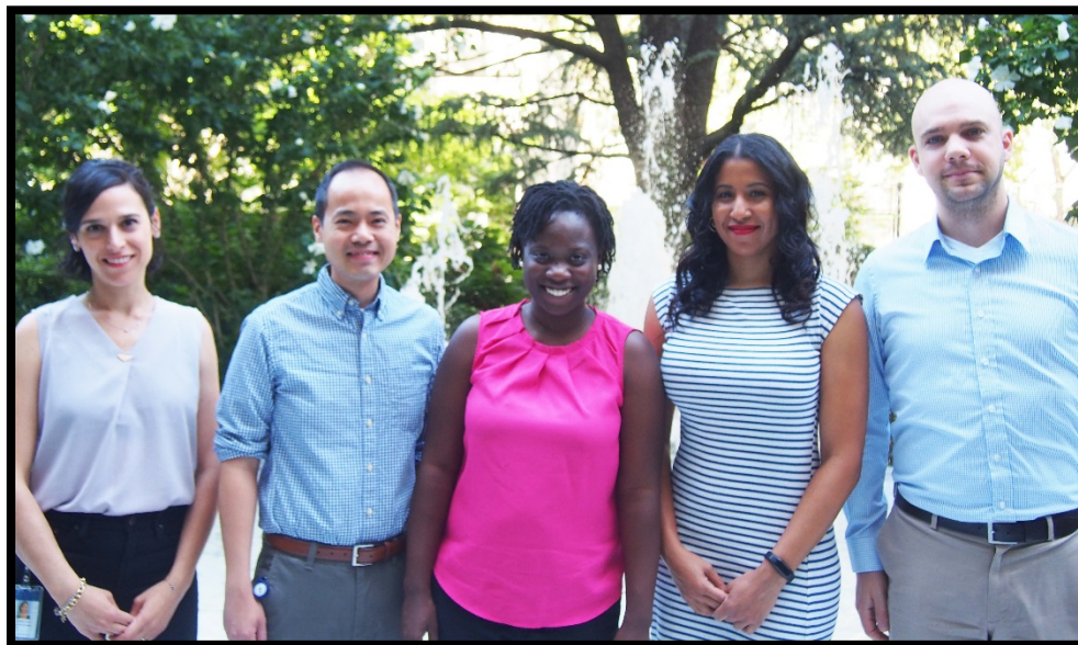
Current Clinical Scholars