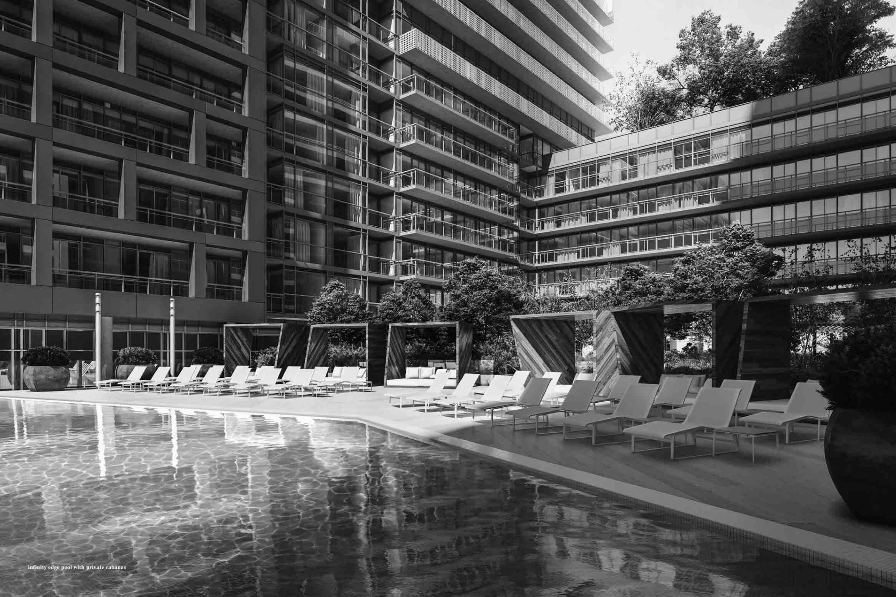
infinity edge pool with private cabanas