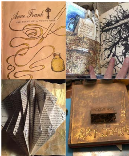
Examples of Melody Weintraub's Altered Books 2021

In this studio workshop you will learn some of the basic methods and mixed-media techniques used in altering a book. You will also learn how this can be beneficial, not only as your own personal art-making experience, but also how it can be taught in the classroom as a way that students can show evidence of learning and artistic expression. A list of supplies will be sent to participants prior to the workshop. All books, some tools and materials will be provided. Limit 25 participants.