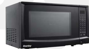
DANBY 0.7 CU. FT.