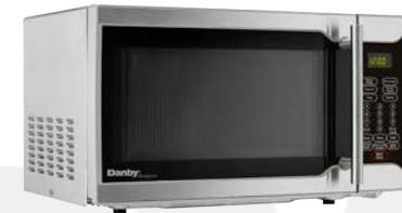
DANBY DESIGNER 0.7 CU. FT.