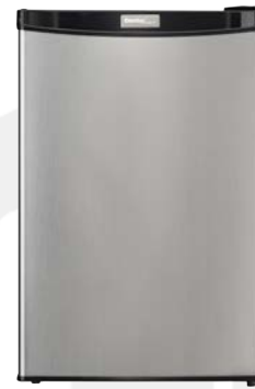
4.4 CU. FT.