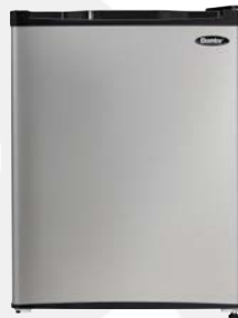
2.3 CU. FT.