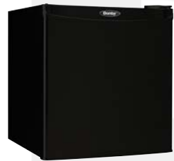
1.6 CU. FT.

Mini-Fridge and Microwave appliances for hospitality.