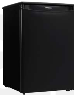
3.2 CU. FT.