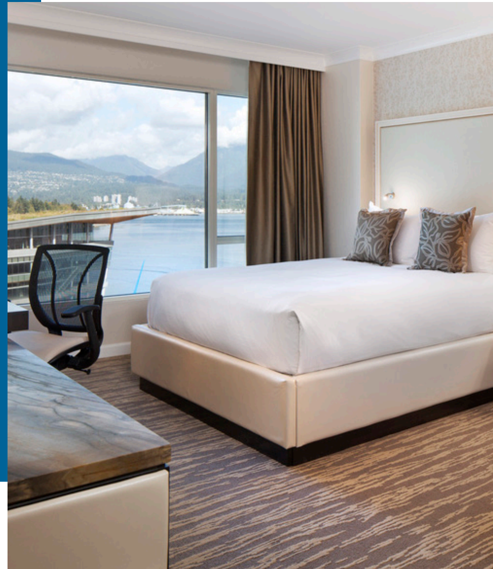
Fairmont Waterfront Vancouver