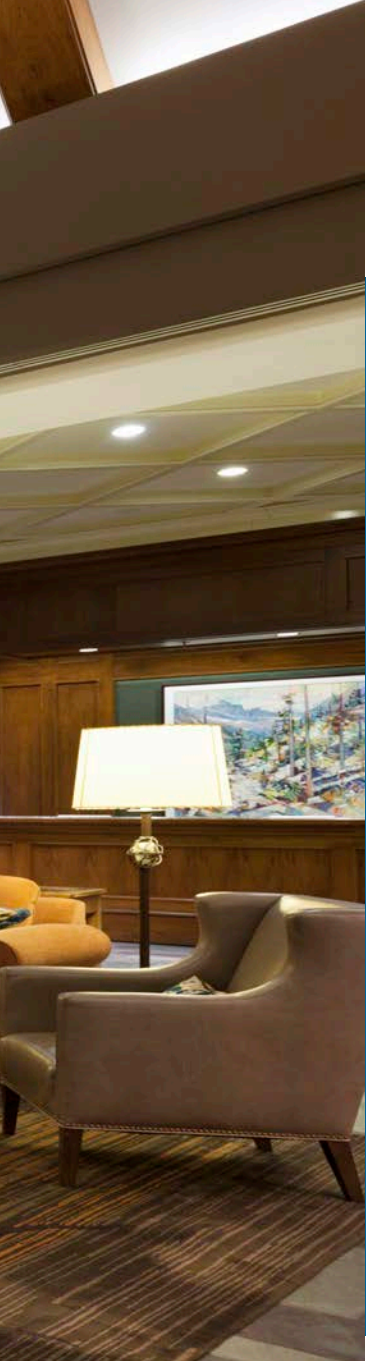
Fairmont Chateau Whistler