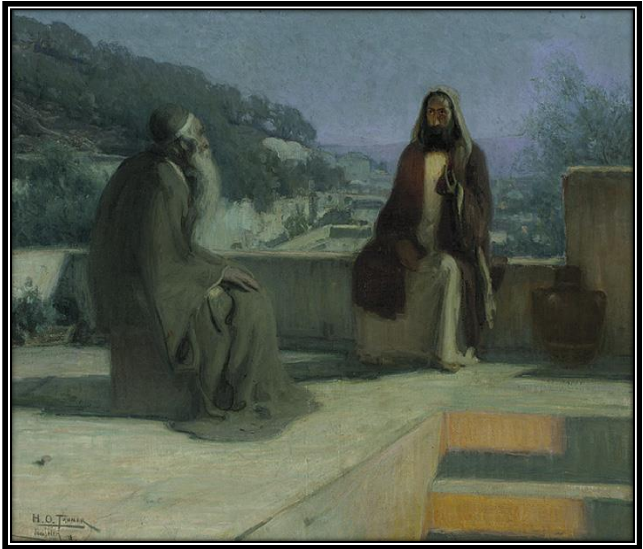
Jesus and Nicodemus by Henry Ossawa Tanner, 1899