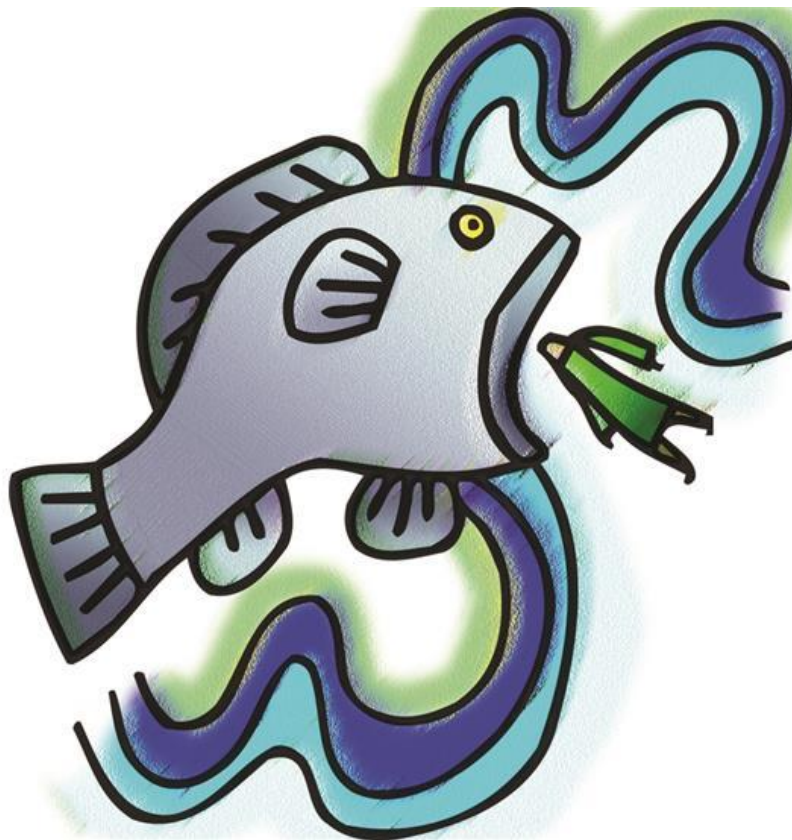
Icon 3, Jonah from Sundays and Seasons