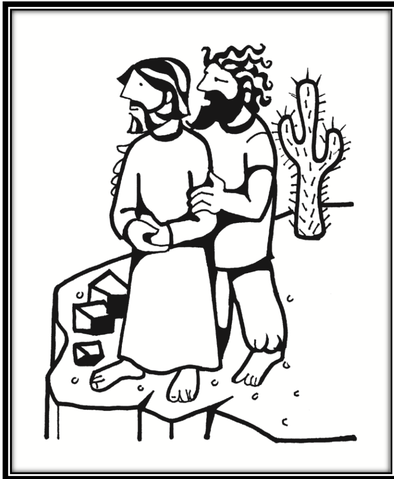
Jesus Tempted by the Devil, Icon 5, Sundays and Seasons

FAITH . DISCIPLESHIP . COMMUNITY THE LUTHERAN CHURCH OF THE GOOD SHEPHERD