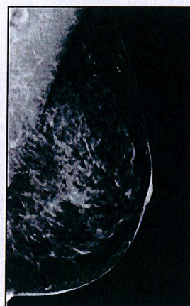
The breasts are heterogeneously dense, which may obscure small masses.