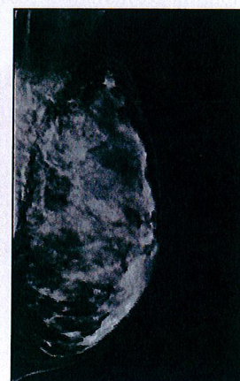
The breasts are extremely dense, which lowers the sensitivity of mammography.

You will get a letter summarizing your mammogram results. If your breast density by mammogram is heterogeneously or extremely dense, this letter may say that you have "dense breasts." Your doctor will also receive a report of your mammogram results with information about your breast density using the categories above.