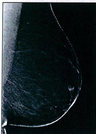
The breasts are almost entirely fatty.

When the radiologist looks at your mammogram, they determine your breast density. There are four categories of breast density. They go from almost all fatty tissue (which is the least dense) to almost all glandular and fibrous with very little fatty tissue (the most dense). The radiologist decides which of the four categories (below) best describes your level of breast density.