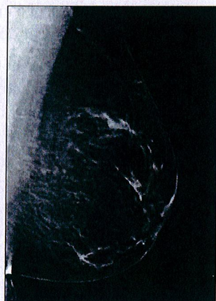
There are scattered areas of fibroglandular density.