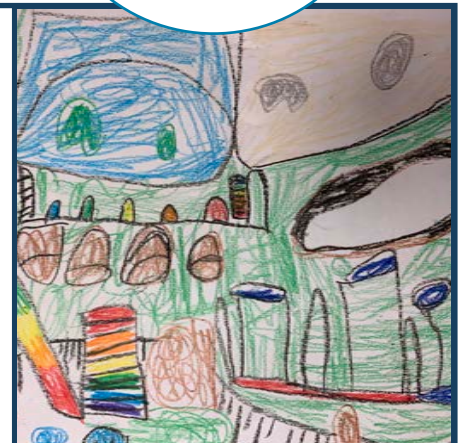
The children in Cascade Village participated in the design process.

Since this past fall, the Living Water Association has received a number of grants. These grants have allowed us to partner with the Akron Community Foundation, the Akron Parks Collaborative, the City of Akron, and a host of other community groups. Through these partnerships, we will be able to put our faith into action and bring much needed resources and programming to the residents of an area of Akron known as Cascade Valley.