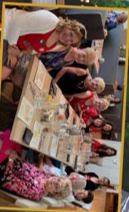
The Ladies from Salaam and Crescent Shriners enjoy breakfast together.