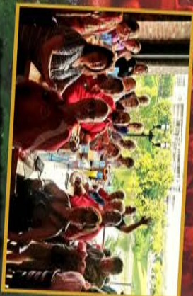
Delegates and Members from Salaam, Nur, Crescent and others enjoy the view from their table at the George Jones Restaurant in Nashville.