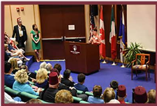
First Annual Donors' Appreciation Luncheon.

Illustrious Potentate Hummel also was very pleased to present a $1,000 donation to the hospital on behalf of Salaam Shrine, resulting in having their name added to the 50th Anniversary Giving Club Donor Wall.