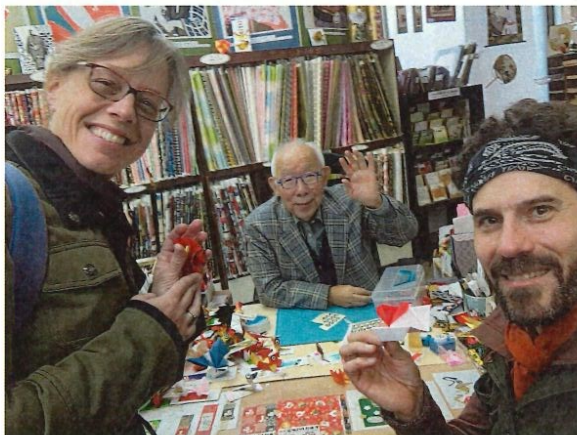
Your Missionaries, talking to the Origami king!

My goodness, has it ever been a long time since we last sent out a newsletter! Apologies for that, but on the plus side, we saw you in person since the last time we wrote! And that was a great and encouraging blessing. We thank you for your ongoing curiosity, commitment, donations, and prayers toward mission work in Japan. We thank you for not being weirded out by the very existence of missionaries!