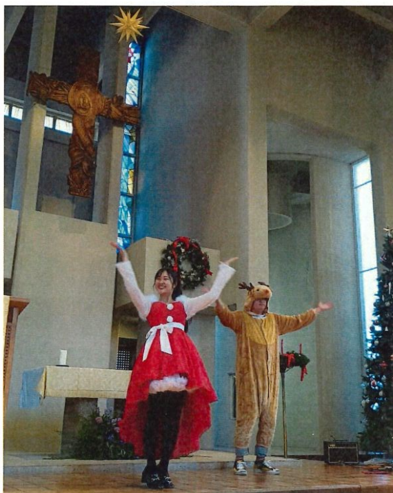
Campus Christmas visit from “teen idol” Santa and her reindeer

respectable, in wider Japanese society. Along with other Christian schools and mission organizations, Japan came to terms with the need for these helping professions. Yet with that came the classic “victim of your own success” syndrome: practically every college teaches these topics now. It has been hard to attract students to this small college for these two fields, and while some non-Christians have also been interested in the third area of study, Christianity, it hasn’t been enough to override the general cultural distance from explicit Christian faith formation.