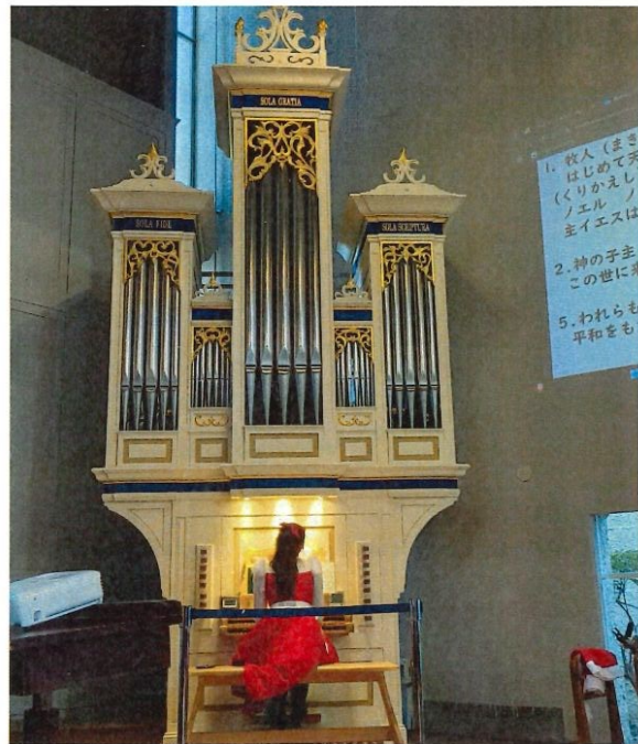
The same teen idol Santa playing Christmas hymns on our historically re-created Baroque organ

So it was that in spring 2024 the board made the painful decision to announce that it was admitting its final freshman class. They have promised to see these and the upperclassmen through to graduation, though with more students transferring out, and various faculty and staff either retiring or seeking positions elsewhere, even that seems unlikely. And maintaining a campus with both administration and upkeep on such a tiny income is yet another challenge.