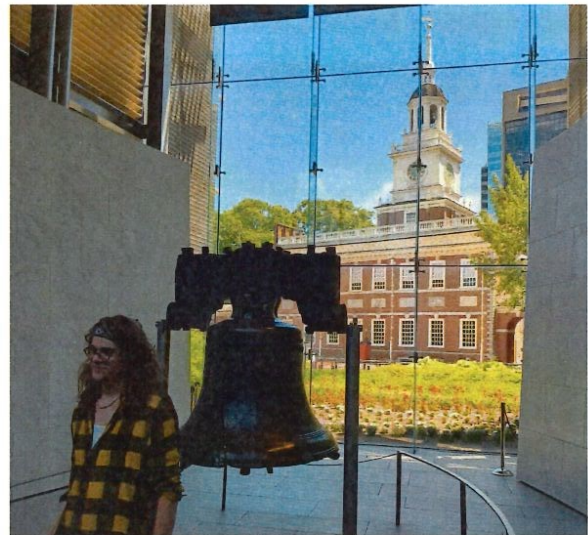
At the Liberty Bell in Philadelphia!

That said, we have some monumentally significant news to share. Which is... we are drawing our missionary service in Japan to a close.