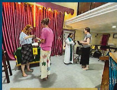
Serving communion with the Bishop last Sunday