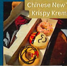
Chinese New Year Krispy Kreme's