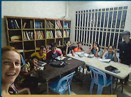
Evening English class! Level 6 **Photo used with students permission