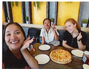
Seafood Pizza ^^ with a mini hotdog crust eaten with ketchup. Cambodia with love. Staff fellowship.

All I've got this month is That's So True , Gracie Abrams —It's really just a catchy tune. Happy to be hearing less of APT -That song ruled the neighborhood for a while. Boy with Luv , BTS came on in a store. Throwback. Yikes!