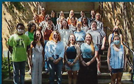
^^^ We are almost to the halfway point!