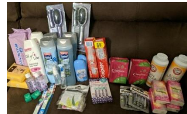
Unit 492 - Columbus