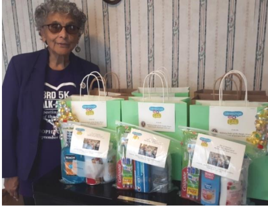
Unit 425 - Augusta