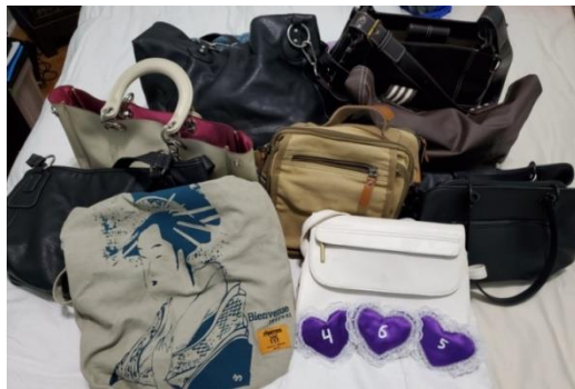
Unit 465 - Atlanta