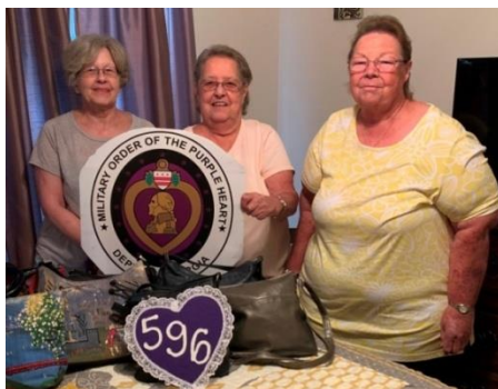
Unit 596 - Savannah