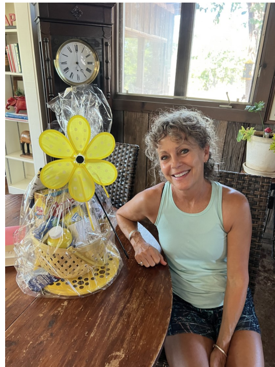
Trip to Smithville to visit these two rays of sunshine.