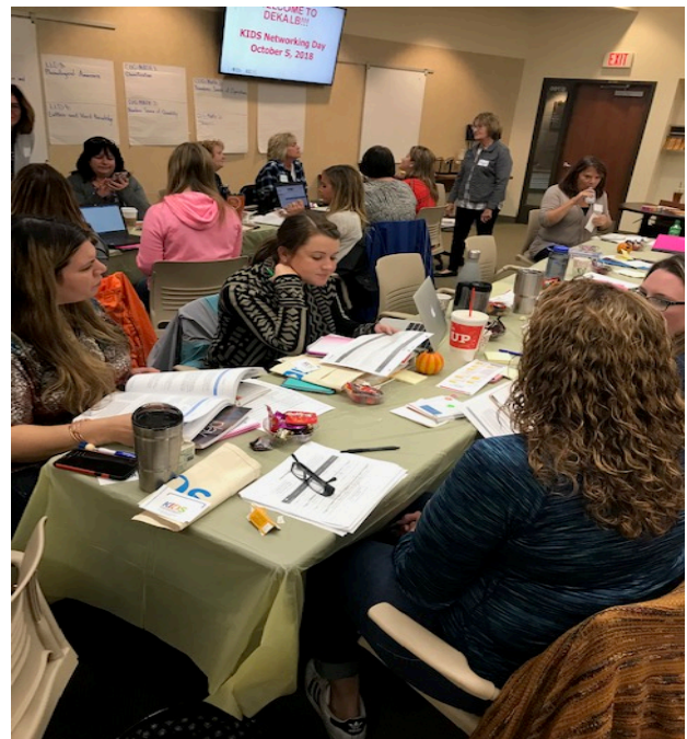
(Above)-Kindergarten teachers and administrators met in DeKalb to network and discuss best practices.

The Midwest Regional Education Laboratory works in partnership with ISBE to offer professional learning opportunities for utilizing the data provided by the KIDS Assessment. This year, their focus is on training district and teacher leaders to facilitate data use sessions for their own districts. These “train-the-trainer” workshops were held in Grayslake and Springfield in October, and will be held in Centralia on Monday, November 5. If your district was not able to send a representative but would like more information on your KIDS data and how to use it to drive improved instruction, please don't hesitate to contact your KIDS Regional Coach.