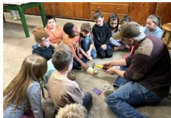
1st & 2nd Grade visit the school forest