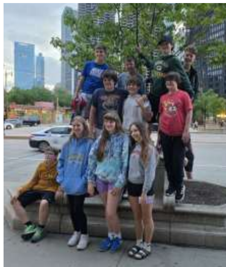
8th Grade Class Trip To Chicago