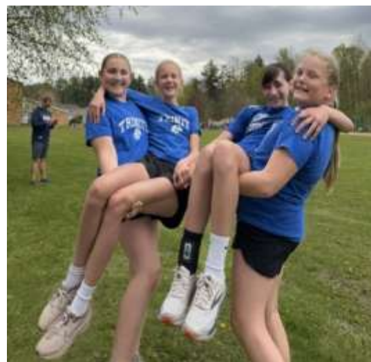
Field Day at St. Paul Bonduel