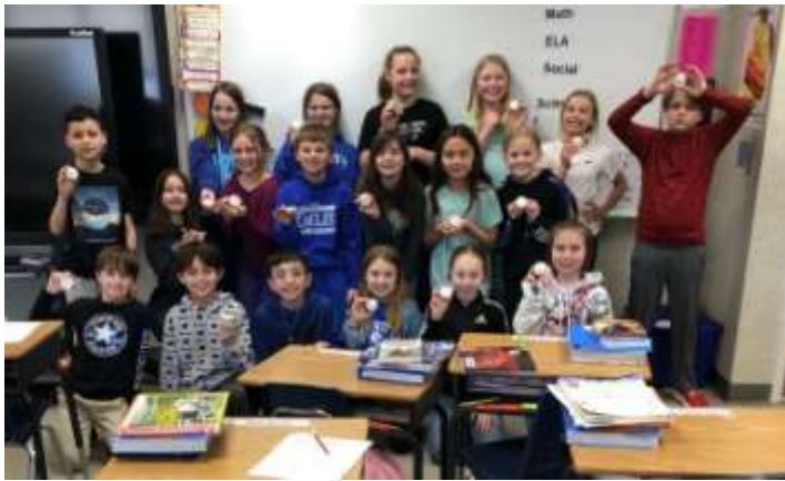
4th Grade is exploring God's amazing creations in Science Class.