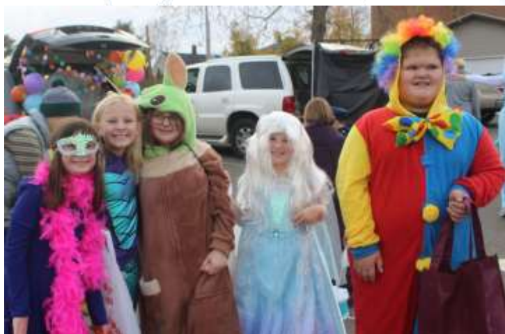
Having fun at Trunk or Treat