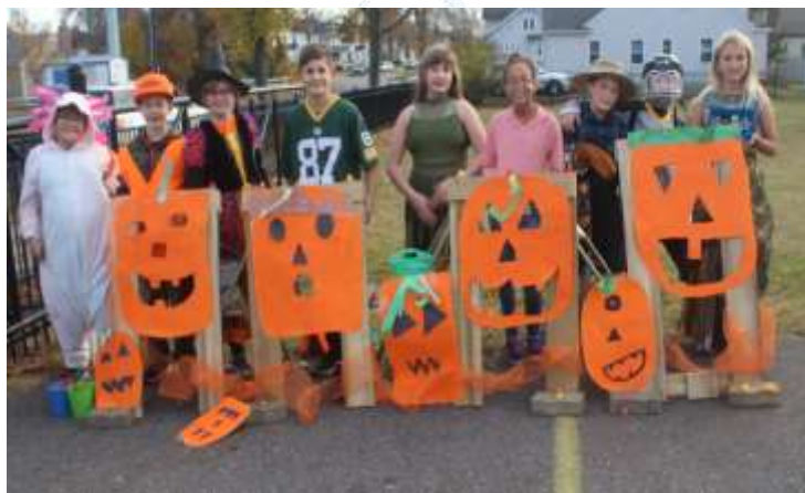
5th Grade students at the Trunk or Treat Event

Trunk or Treat was a hit this year at Trinity. We had a parking lot full of cars handing out candy, and many trunk or treaters coming to get treats from both our school and the community. Thanks to everyone that got involved with loaning out a trunk for the event and/or donating candy, as well as those who put the event together.