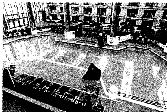
Pool level Atrium Suites will serve as Hospitality Rooms at a cost of $99.00 plus tax ($110.90). Add'l $30 charge to remove beds.

Reservation cut-off date will be September 20, 2020