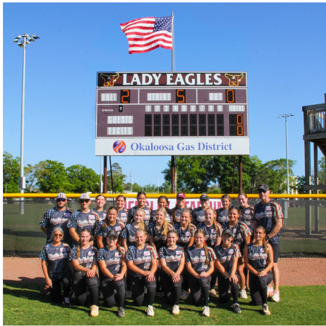
(Niceville High School Softball Lady Eagles and Coaches)