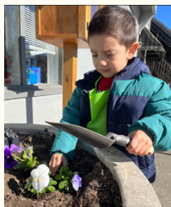
Special Moments from Plant A Seed Event

Monday 10-1 Tuesday 10-1 Thursday 10-1 Friday 10-1 Saturday 2nd & 4th 9:30-11:30