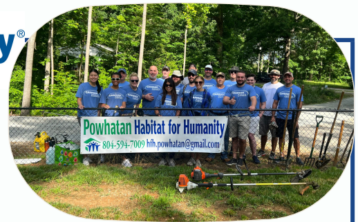
CarMax Cares Volunteers