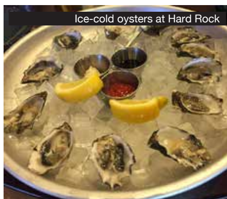
Ice-cold oysters at Hard Rock

had freshly shucked Mission oysters served over ice with cocktail sauce, horseradish, and a mignonette. The oysters are fresh and cold. Great deal! Other choices include crab cakes ($14), fish & chips ($24), and several pan roasts and seafood soups ($21-$28). Hours are 11 am to 10 pm, so you can avoid prime time, during which it gets a bit busy. ■