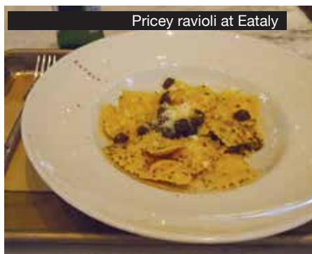
Pricey ravioli at Eataly

to $31.39—it was a good snack, but pretty steep for a warm-up to dinner. Frankly, what would you expect? Eataly’s general manager told USA Today that he believed everything is “well-priced.” But