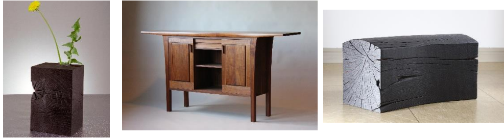
Per Brandstedt, Sweden, Artist

The processes of conceptualization, design, and fabrication are inherent in Brandstedt's work. He is invariably driven to test the limits of his material and conventional technique. His works are investigations into the experiential aspect of form and materiality. He creates objects to be interacted with, touched, sat upon, and reflected upon; objects which build poetic relationships with the people who interact with them.