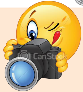
PHOTO CONTEST COMING SOON

B.K. Automotive Bowers Garage Broadway Auto Services Bryan's Automotive C&T Auto Care Douey's Tires Foreign Auto New & Used Wholesale Tires Lane's Towing Phillip Car Auto Body