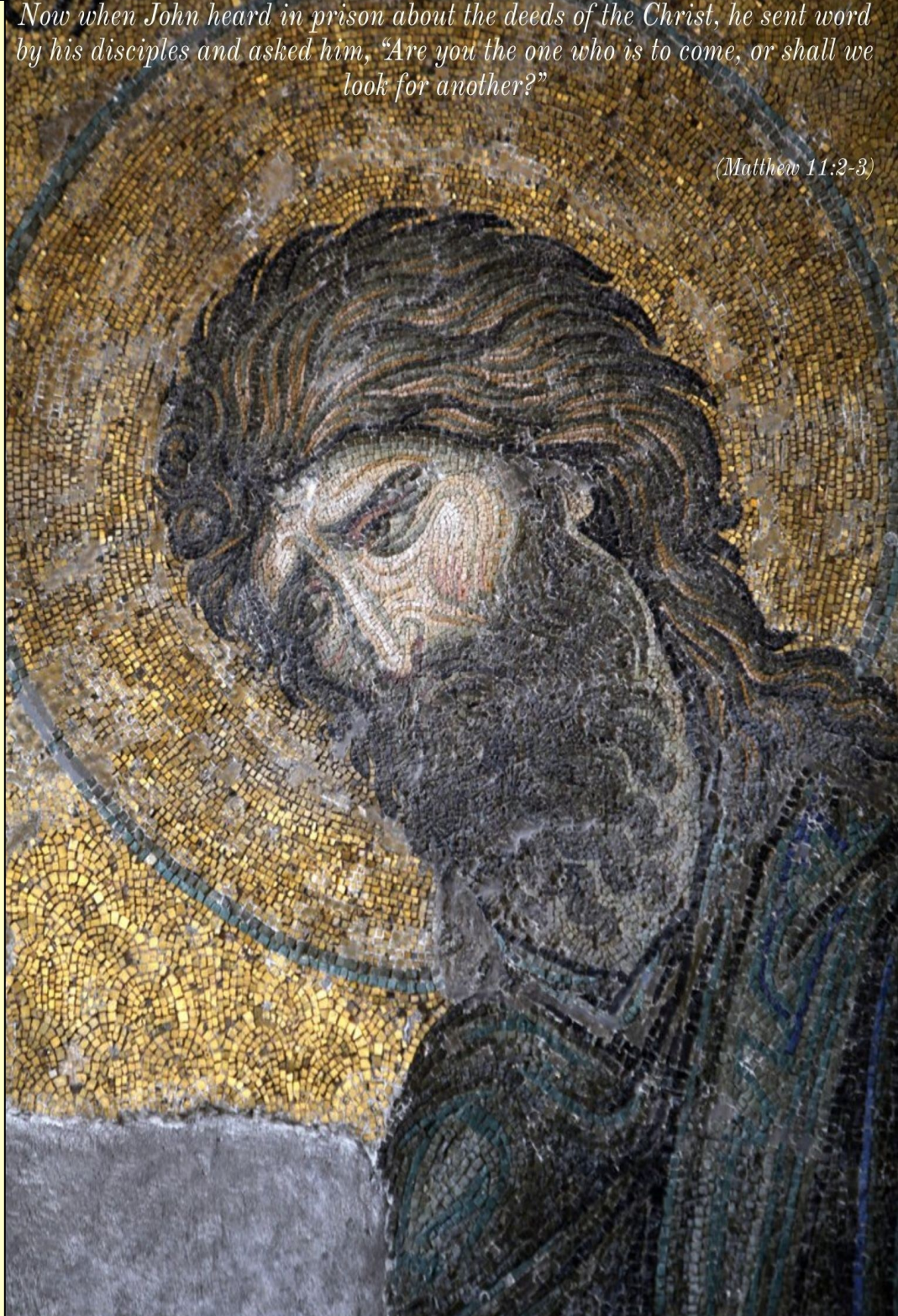
Byzantine Mosaic of St. John the Baptist, from the Deësis panel, located in the Hagia Sophia in Istanbul, Turkey.