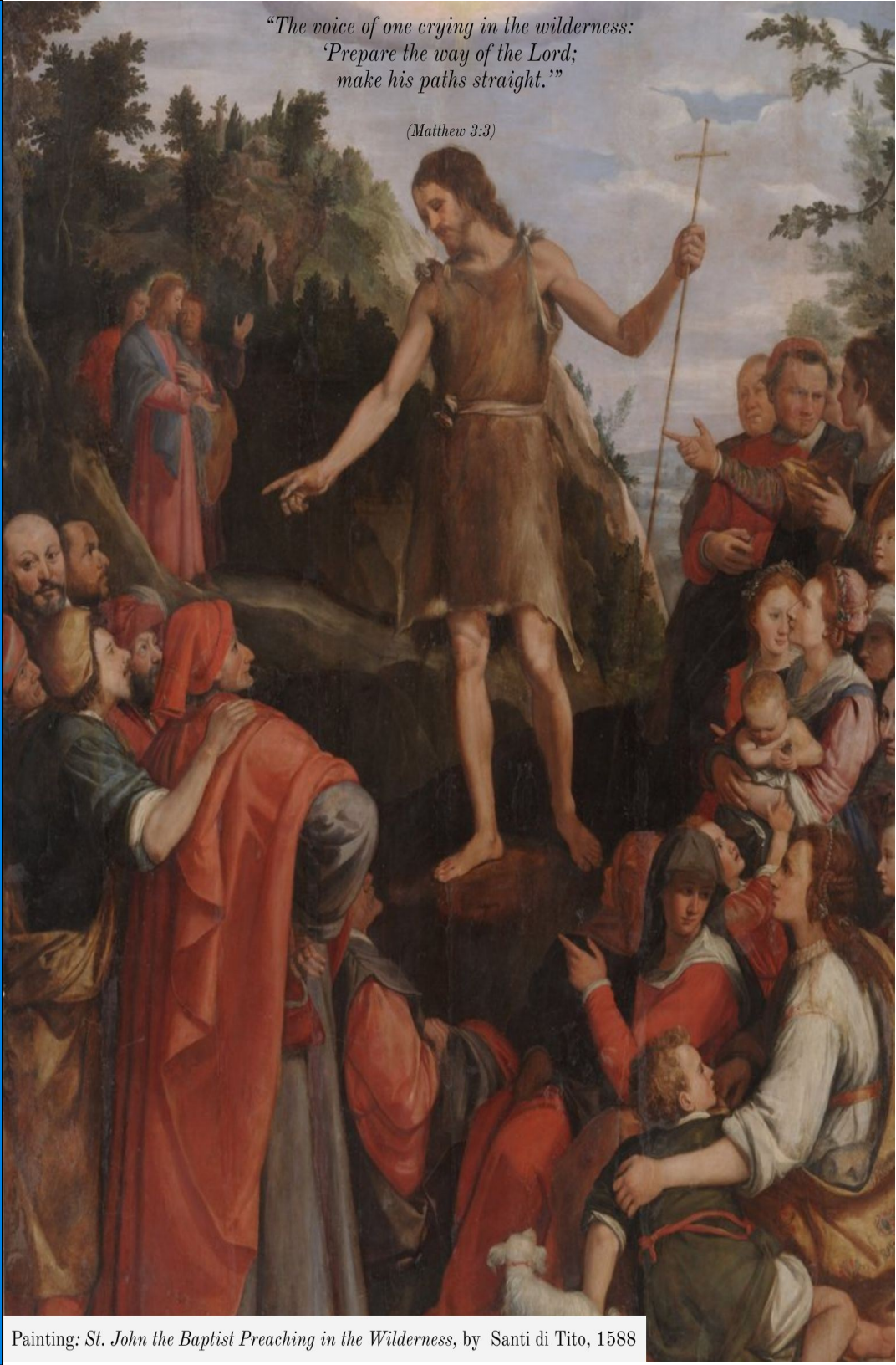
Painting: St. John the Baptist Preaching in the Wilderness , by Santi di Tito, 1588