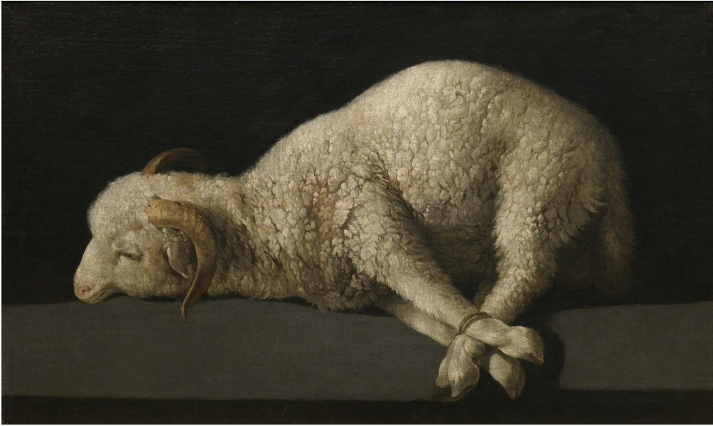
Painting, Agnus Dei, c. 1635-1640, by Francisco de Zurbarán, Prado Museum.