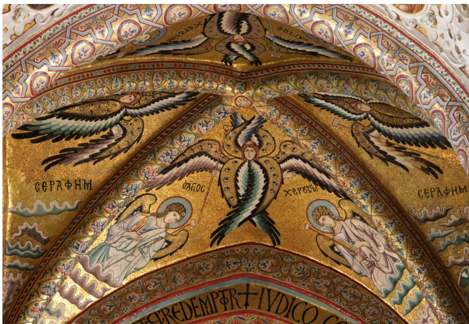
Byzantine Mosaic, Cherubim and Seraphim , 12th Century. Housed at Duomo di Cefalù , (Cefalù Cathedral) in Sicily Italy.