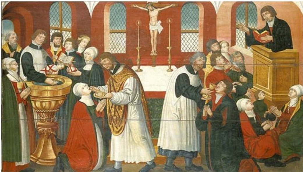
Altar frontal, Luther's German Mass , from the Torsslunde Church on Zeeland, Denmark, dating back to 1561. (Public Domain)