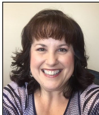
Director of Evangelization, Catechesis, and Youth Formation, Diocese of Springfield Cape Girardeau