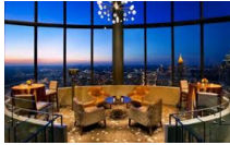
Sun Dial - Restaurant atop the Westin for bird's eye city views. 210 Peachtree St NW.