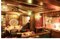
Trader Vic's - Tiki bar & live music. 255 Courtland St NE.