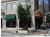
Ted's Montana Grill - 133 Luckie St NW.