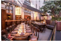
Alma Cocina - Latin fare. 191 Peachtree St NW.