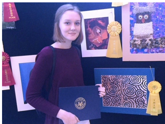
Dixie Devor earned 3rd place in the photography category for her photo of this circular pattern.