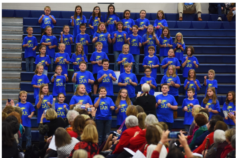
The fourth grade program, "Rise and Shine, America!", featuring entertaining songs and charming choreography.

The program also featured musical performances by the Fourth Grade Choir and the High School Choir and all KDS students singing "DAR, Oh How We Love You" to a rousing response.