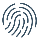
INVESTIGATE OUT OF SPECIFICATION