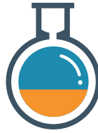
MEASURE PRODUCT STABILITY