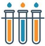
VERIFY API CONCENTRATION