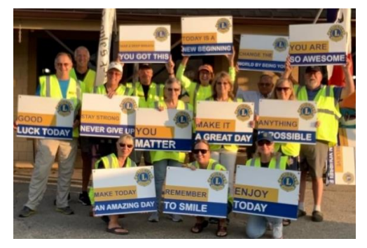
"FEEL GOOD DAY" Wakefield Lions were out and about throughout Wakefield and Middleton holding their signs of positive messages to help the two communities have a great start to their day either at school or at work. Great feedback from the townsfolk!!