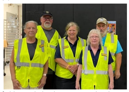
Wakefield Lions helped serve a BBQ lunch to students and their families for a Back to School celebration.