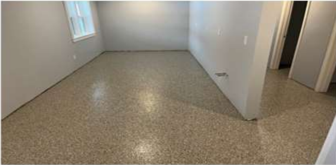
Beautiful new kitchen and bath floors