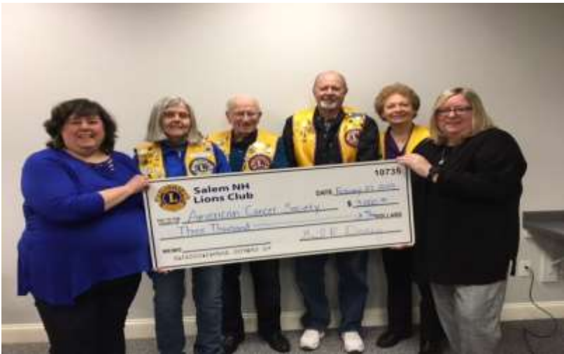
Salem Lions just donated to Relay for Life for Childhood cancer research.