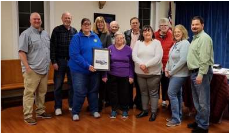
Salem Lions were recently recognized for restoring the cannon on the town common.