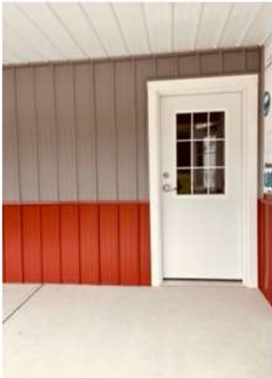
Pavilion color scheme