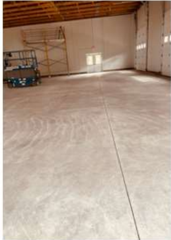
Cleaned up and looking sharp