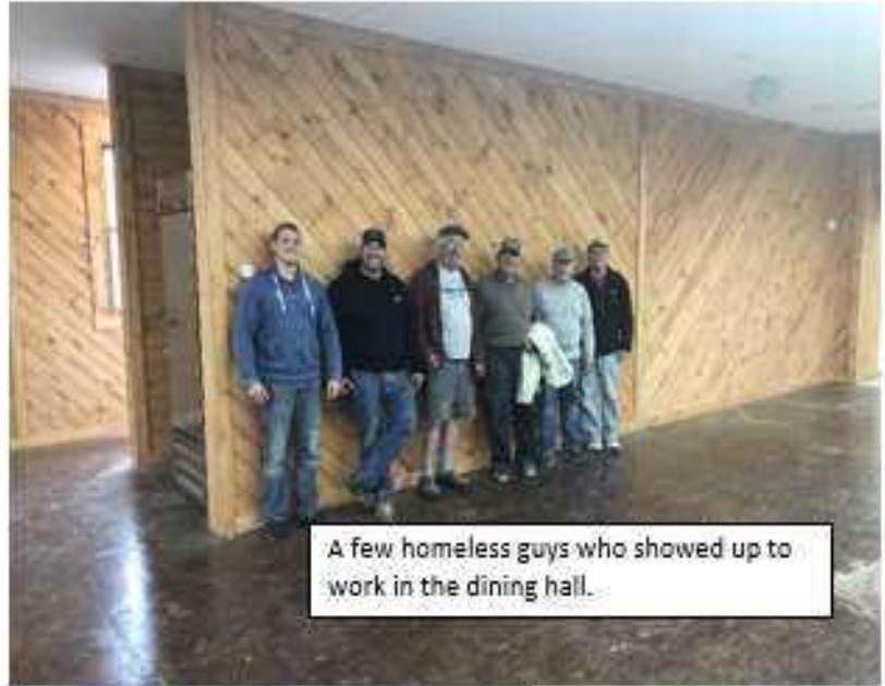
A few homeless guys who showed up to work in the dining hall.