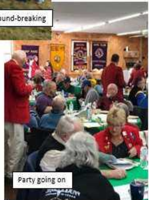
Party going on