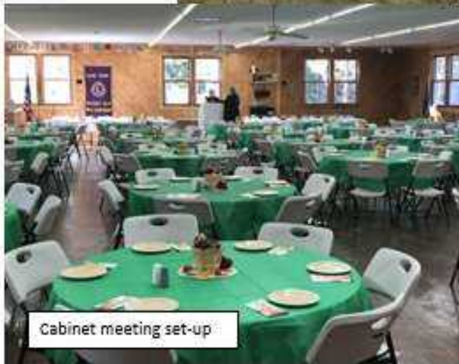
Cabinet meeting set-up