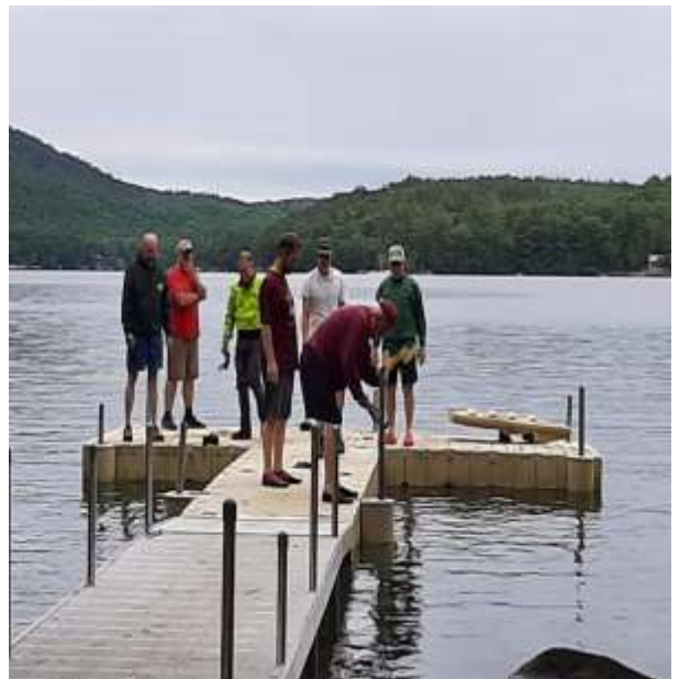
Docks are in. Thanks guys!!