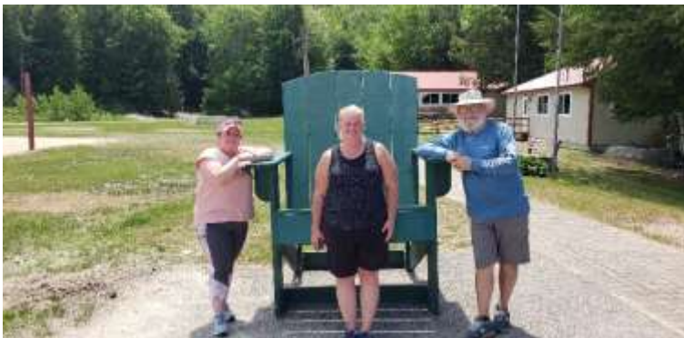
Danville Lions resting after raking leaves all day!