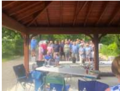
Hampstead special awards /installations