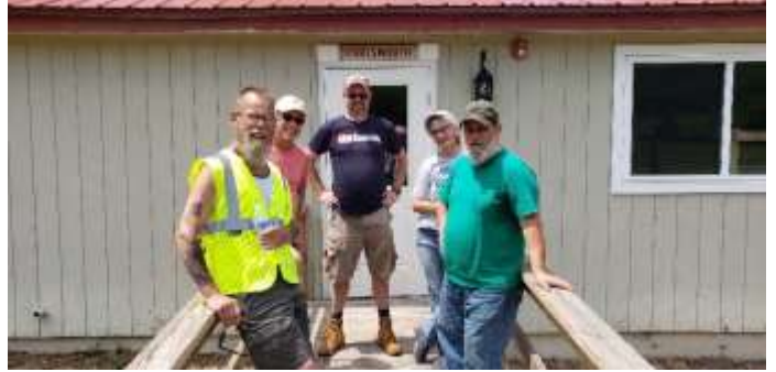
Wakefield Lions taking over their new building