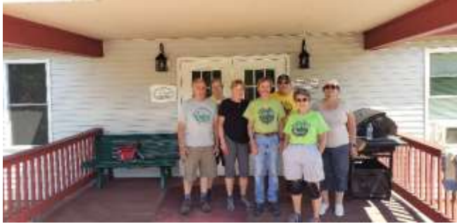
Wolfeboro Lions doing their thing