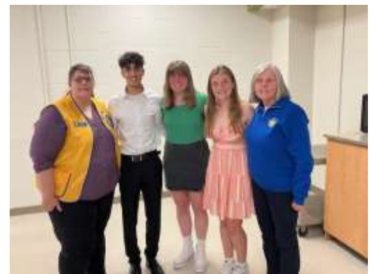
We gave 3 student's scholarships for their community service.

A check was presented to the theatre arts program at the high school to help with the cost for the right to perform Frozen next year.