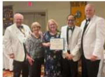
Receiving Best Large Club Award