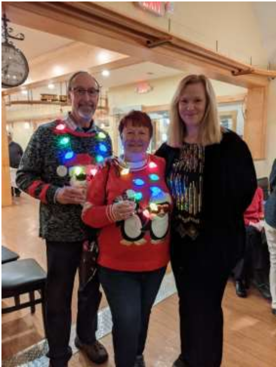
New members at our Christmas Party