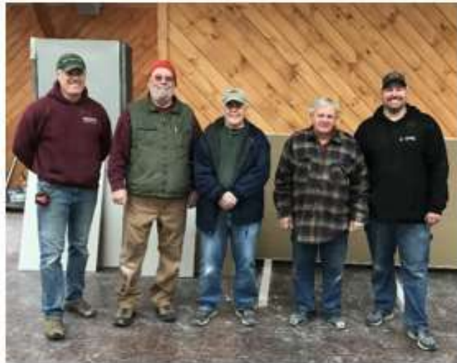
The plumbing and drywall crew + one electrician.