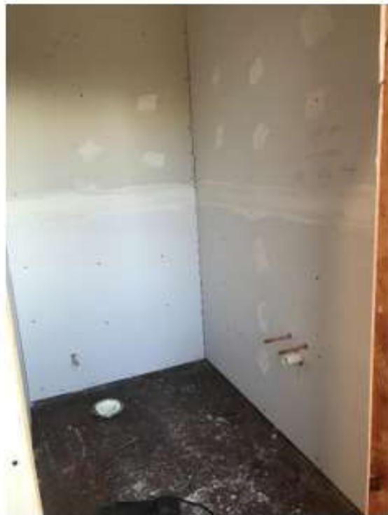
Drywall started in one of the new baths.