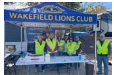
East Wakefield Fall Festival