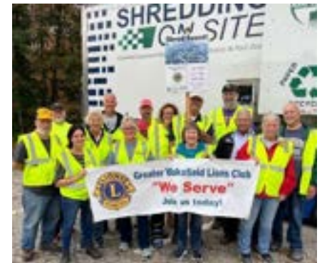
Shred Event was a huge success!