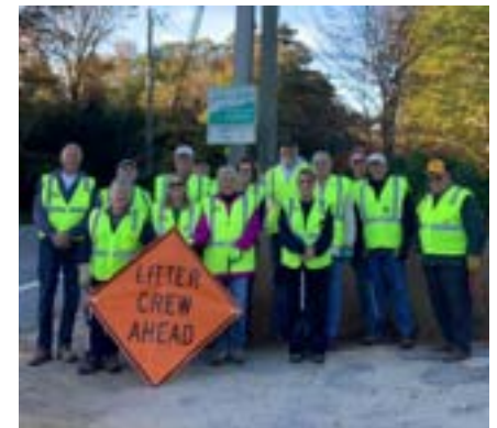
Roadside clean-up crew