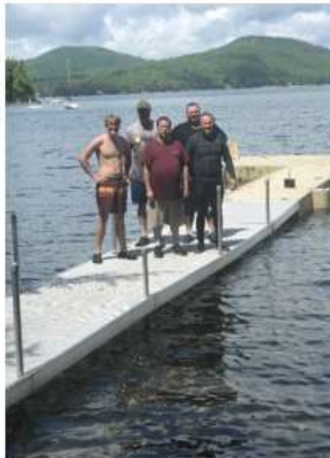
2022 dock crew