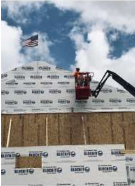
Official flag raising