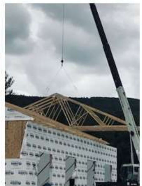
Trusses going in