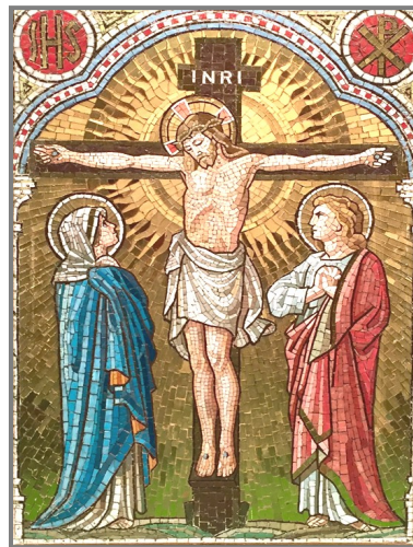
The mosaic on the door of the altar tabernacle, Church of the Ascension