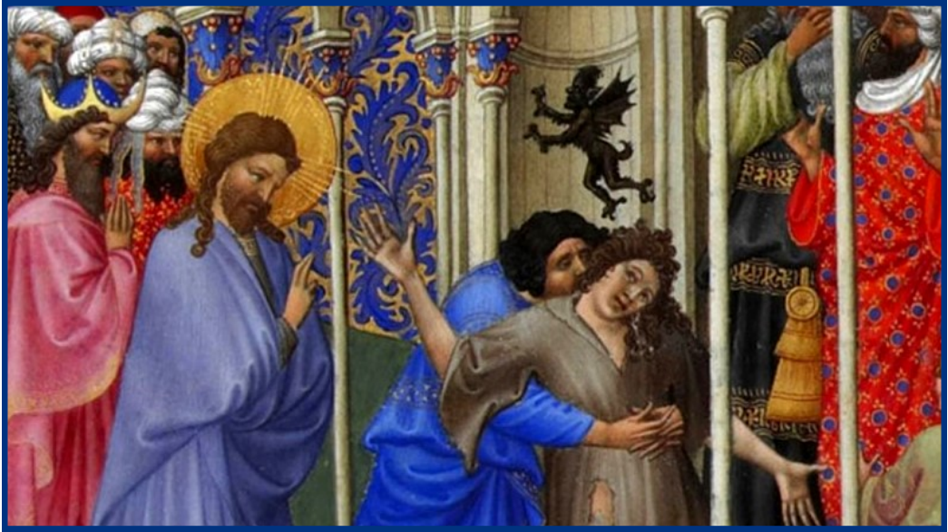
Illumination detail: Christ heals a demon-possessed man , from Très Riches Heures (Very Rich Hours) of the Duke of Berry, 15th C.