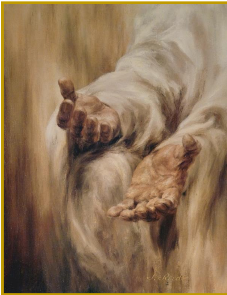
Come Unto Me , oil on canvas, Joann M. Reed [© 1967. Used with Permission of the Artist.]

The Sixth Sunday after Pentecost 11 a.m. Solemn High Mass July 5, 2026 Church of the Ascension