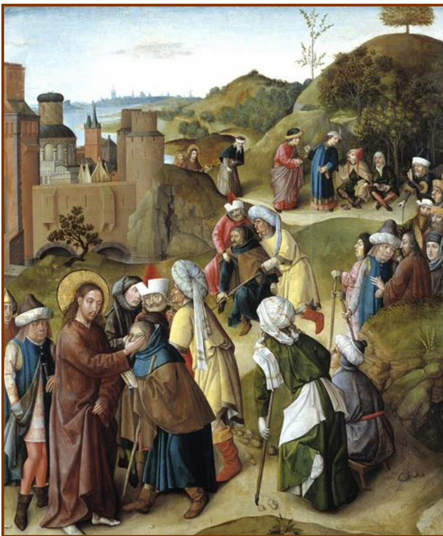
Healing of the Blind Man at Jericho , Master Zeno or Van Evert Zoudenbalch, c. 1470-1479, Museum Catharijneconvent, Utrecht, Netherlands