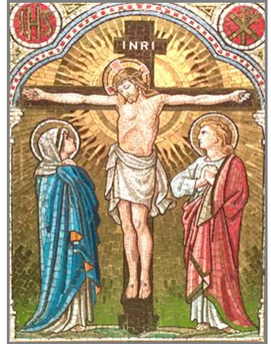
The mosaic on the door of the Altar tabernacle, Church of the Ascension

WELCOME TO THE CHURCH OF THE ASCENSION 1133 N. LA SALLE BOULEVARD CHICAGO, IL 60610 312. 664. 1271 office@ascensionchicago.org www.ascensionchicago.org