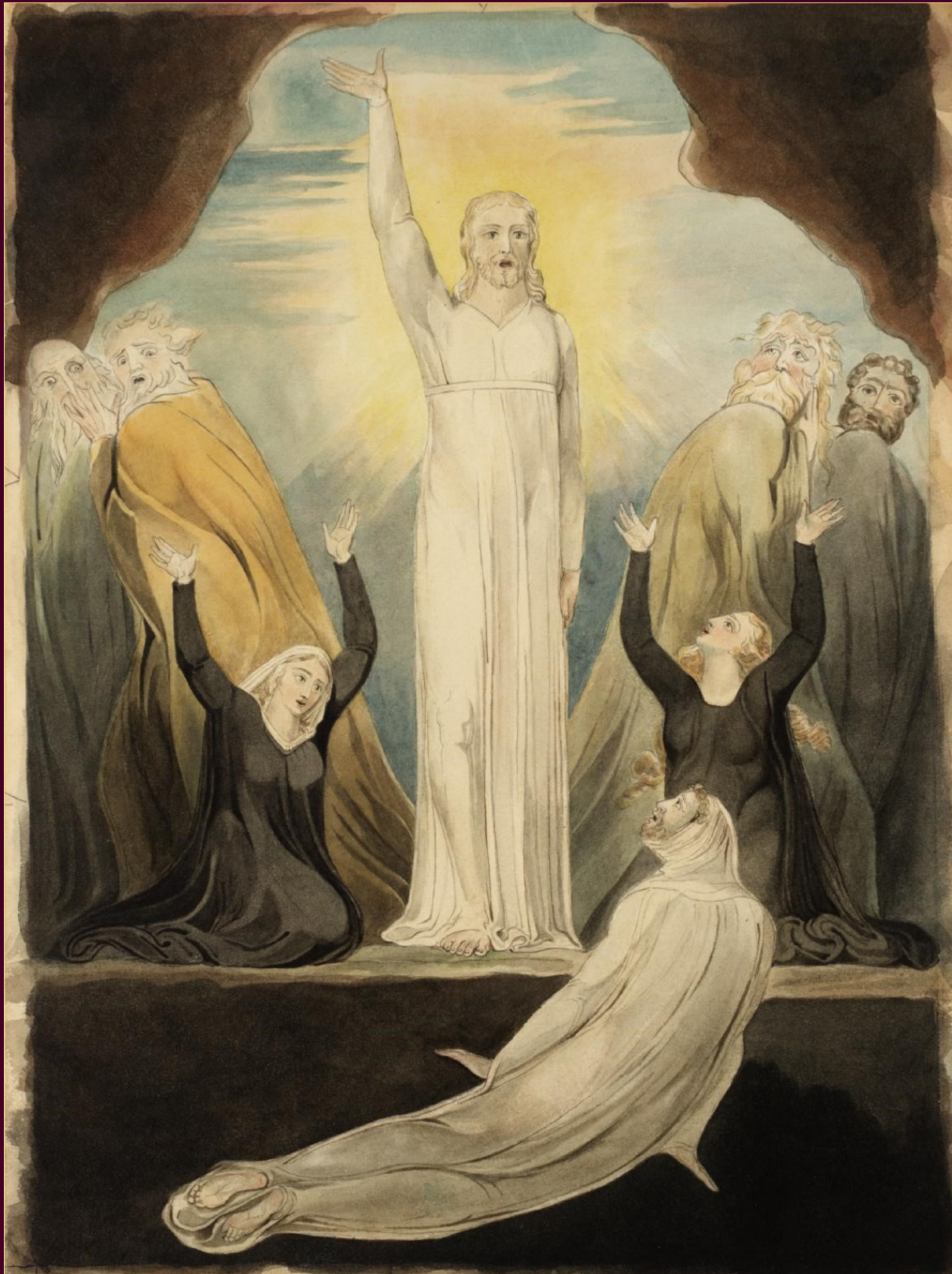
The raising of Lazarus, after William Blake, late 19th or early 20th century, Tate Gallery Collections