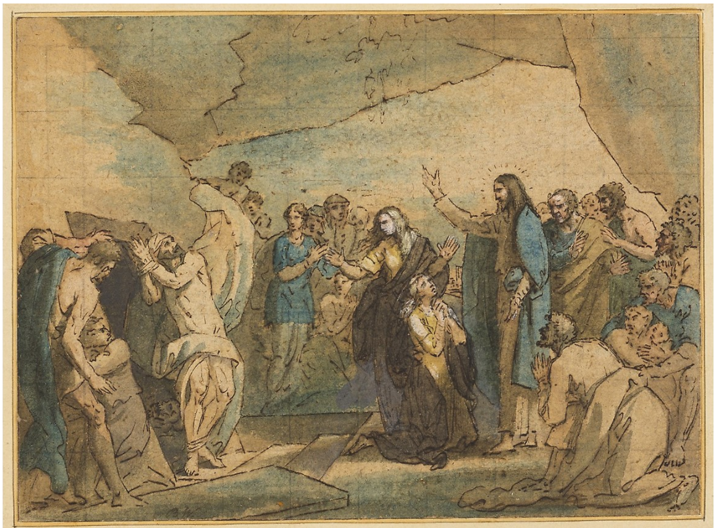
The Raising of Lazarus, 1780, Benjamin West, collection of the Art Institute of Chicago